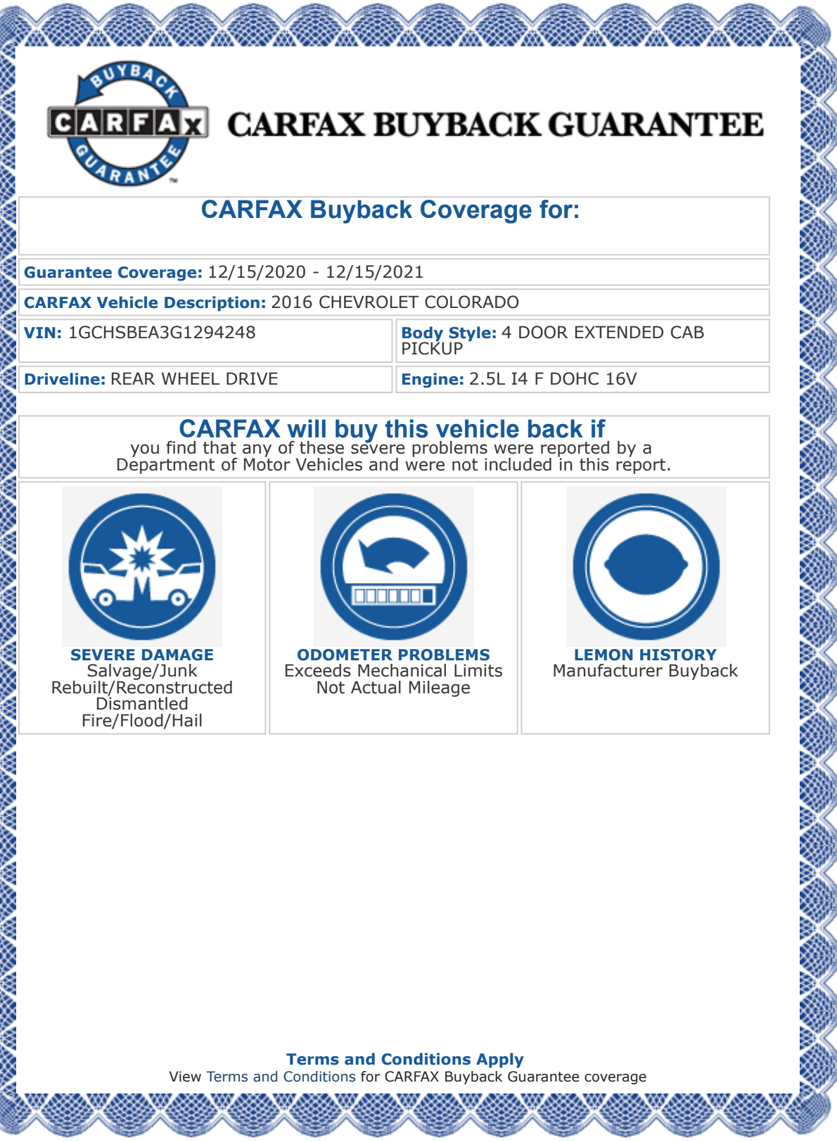
\odot 2020 CARFAX, Inc., an IHS company. All rights reserved. Patents pending. 12/15/2020 11:22:02